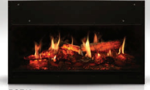
PGF10 760 mm x 450 mm x 353 mm