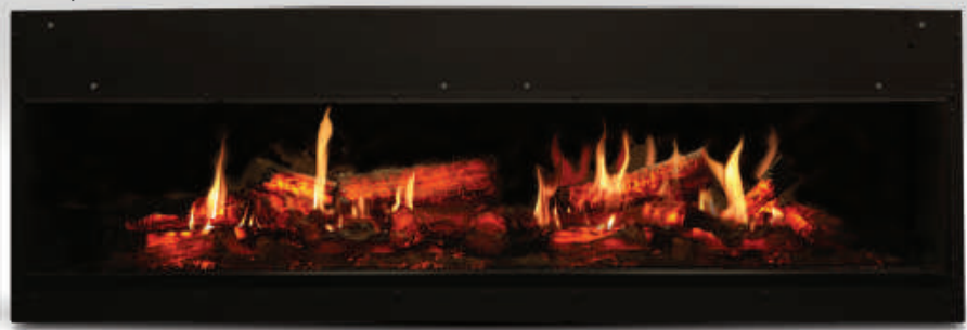
PGF20 1380 mm x 450 mm x 353 mm